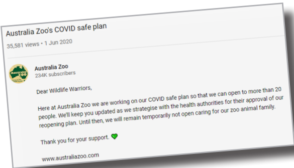
Social Media post from the Australia Zoo