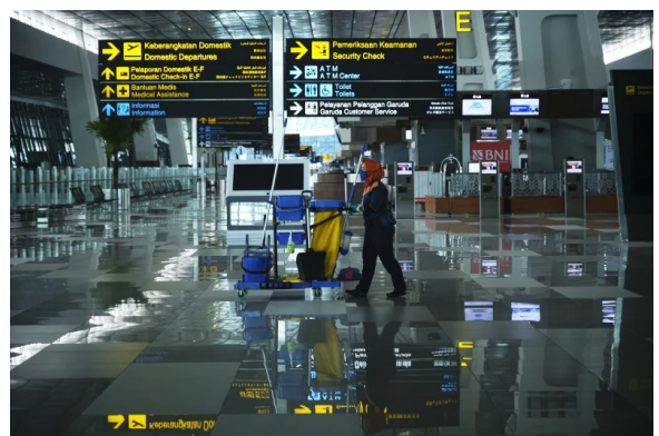
Photo of the Day - A cleaner walks through the nearly empty Int. Airport in Jakarta, Indonesia.

The true figure is expected to be far higher due to the lack of widespread testing in many countries.