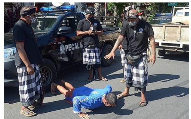
Photo of the Day - Individual Security officers in Bali appear to be reprimanding locals and visitors who aren't wearing masks by making them stop and do push-ups, according to local insight reports. There does not appear to be an official policy from local authorities.

The Prime Minister again said one of the most important tools to help fast-track restrictions being lifted was the Government's COVIDSafe tracing app.