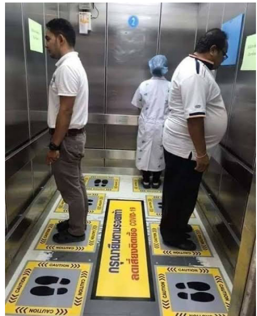
Photo of the Day - Social Distancing in an elevator in Thailand