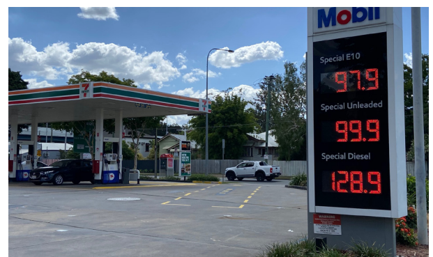
Photo of the Day - Petrol Prices during COVID-19

RACQ is asking everyone to follow the recommendations of health experts and take measures to protect themselves. It is important to not get complacent when filling up the car, touching a pump should be like touching any other surface. Simple hand-washing techniques taken by all would prevent this from occurring. It is recommended that motorists may also want to wipe down their steering wheel and door handles as well, and remember to keep a 1.5 metre distance when lining up to pay for their fuel.