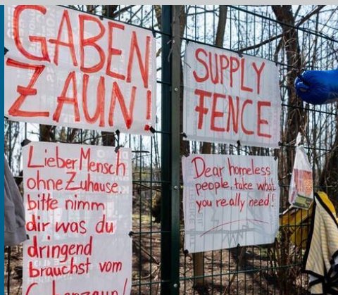
Photo of the Day - Italy's Symbol of Hope

Germany has over 84,600 confirmed cases (including 2,300 medical staff), but only 1,097 people died from COVID-19 there, putting Germany's case fatality rate at just 1.29%. According to experts, Germany's case fatality rate is so low due to its widespread testing and the fast response. However, an entire hospital in Munich had to close down because almost all doctors and nurses got infected with COVID-19.